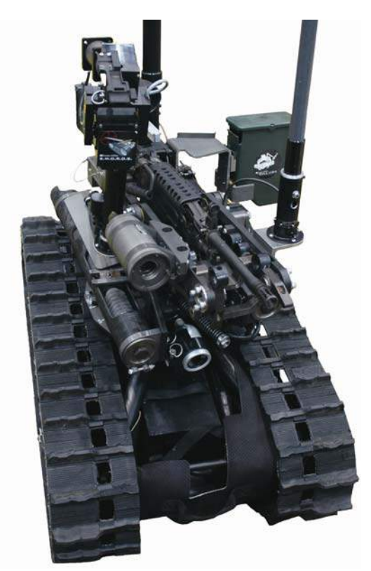
Figure 3. Foster-Miller TALON SWORDS Robot

It is interesting to note that soldiers have already surrendered to unmanned aerial vehicles ("UAVs") even when the aircraft has been unarmed. The first documented instance of this occurred during the 1991 Gulf War. An RQ-2A Pioneer UAV, used for battle damage assessment for shelling originating from the USS Wisconsin, was flying toward Faylaka Island, when several Iraqis hoisted makeshift white flags to surrender, thus avoiding another shelling from the battleship.<sup>18</sup> Anecdotally, most UAV units during this conflict experienced variations of attempts to surrender to the Pioneer. A logical assumption is that this trend will only increase as UAVs' direct response ability and firepower increases.