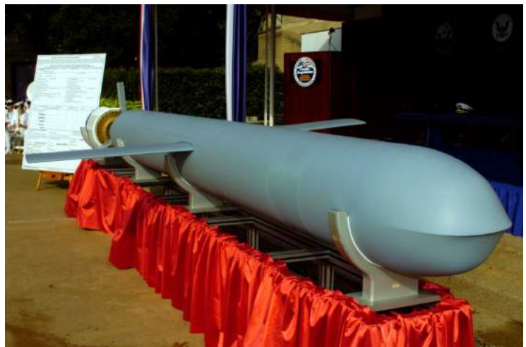
Figure 2. Tomahawk Cruise Missile on Display

In 2001, Congress issued a mandate that stated that by 2010 one-third of all U.S. deep strike aircraft should be unmanned and by 2015 one-third of all ground vehicles should be likewise unmanned.<sup>12</sup> More recently, the United States Department of Defense ("DOD") issued in December 2007 an Unmanned Systems Roadmap spanning 25 years, reaching until 2032, that likewise anticipated and projected a major shift toward greater reliance on unmanned vehicles in U.S. military operations.<sup>13</sup>